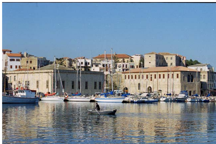
Conference Center: www.kam-arsenali.gr