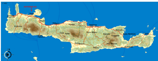
Crete Island ( www.creteisland.gr )