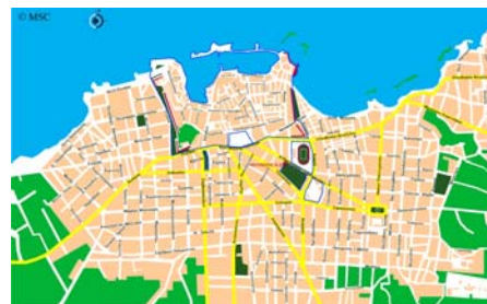
Town map of Chania ( www.chania.gr )