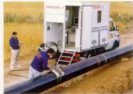
Data acquisition system mounted in 4x4 truck

Our PIPESCAN has been qualified by C.T.O. -Gaz de France and by Petrobras for automatic ultrasonic inspection