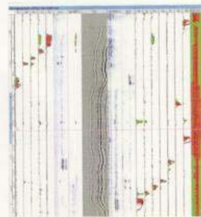
Automatic ultrasonic inspection result