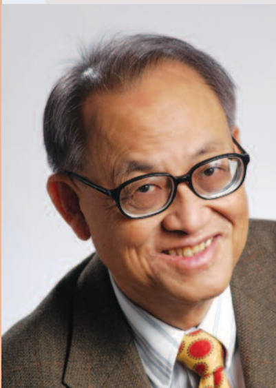
Prof. Leon O. Chua

Participants of 11 th ECNDT 2014 have entrance free.